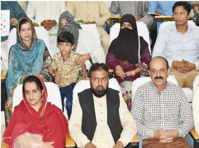
School Children Participation